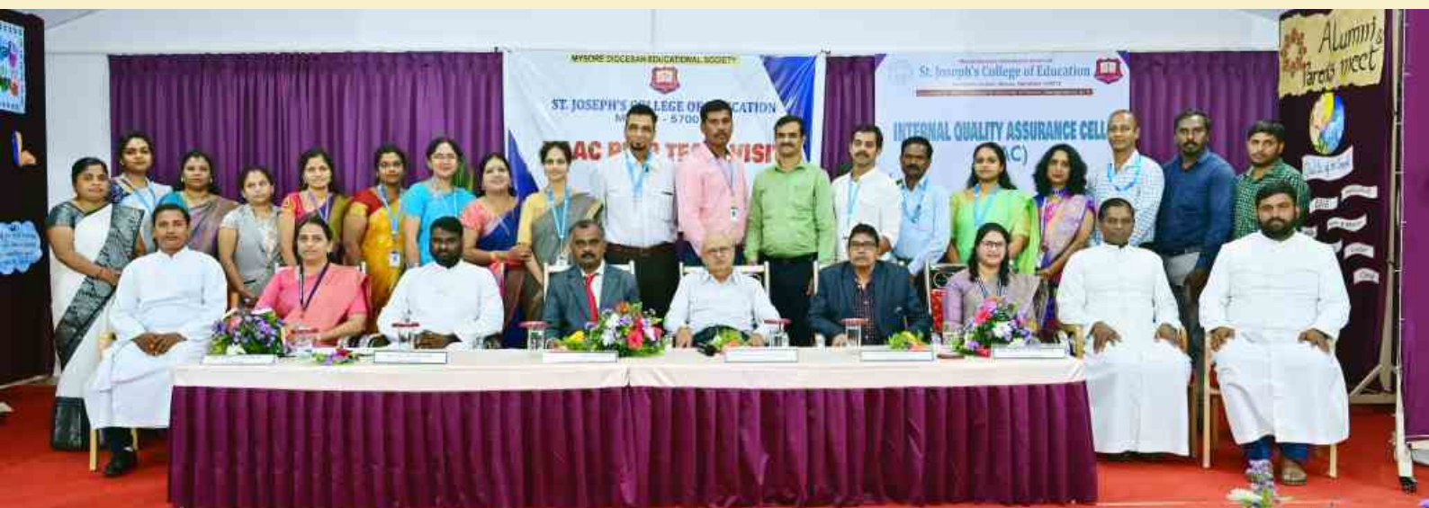
NAAC PEER TEAM VISIT - 2022